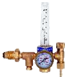
Optional Argon Regulator