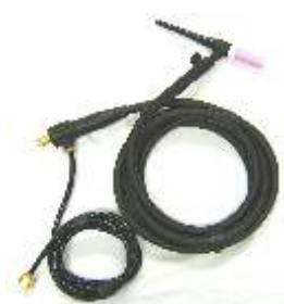
Optional TIG Torch