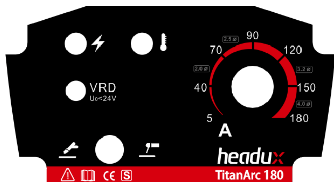
TitanArc 180 Control Panel