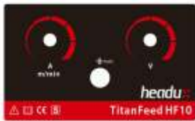
TitanFeed HF 10 Control Panel