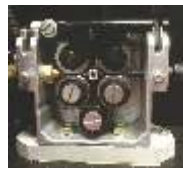
4 Roll Metallic Drive System