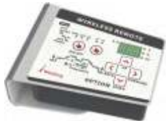
Optional Wireless Hand Control