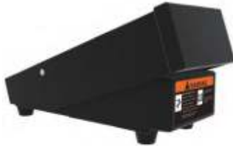
Optional Wireless Foot Control

The TitanTig 200 Pro is a professional, microprocessor controlled inverter welding power source for AC Tig, DC Tig and MMA Applications. The use of IGBT technology delivers a compact and lightweight machine that is feature rich. High frequency ignition and a pulse function on both AC and DC modes makes this machine ideal for sheet metal and fine precision work.